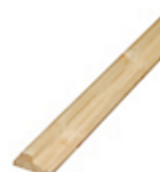
Metsäwood Untreated Redwood Dado Rail (L)2.4m (W)45mm (T)20mm