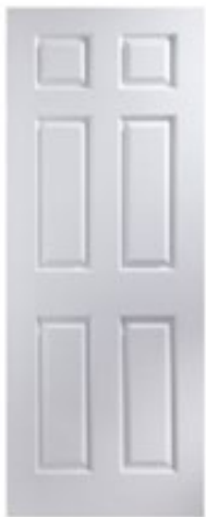
6 Panel Primed Woodgrain Internal Fire Door, (H)1981mm (W)686mm