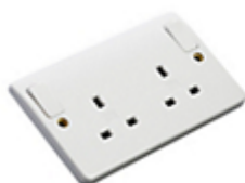
MK Low Profile White Switched Double Rocker Socket